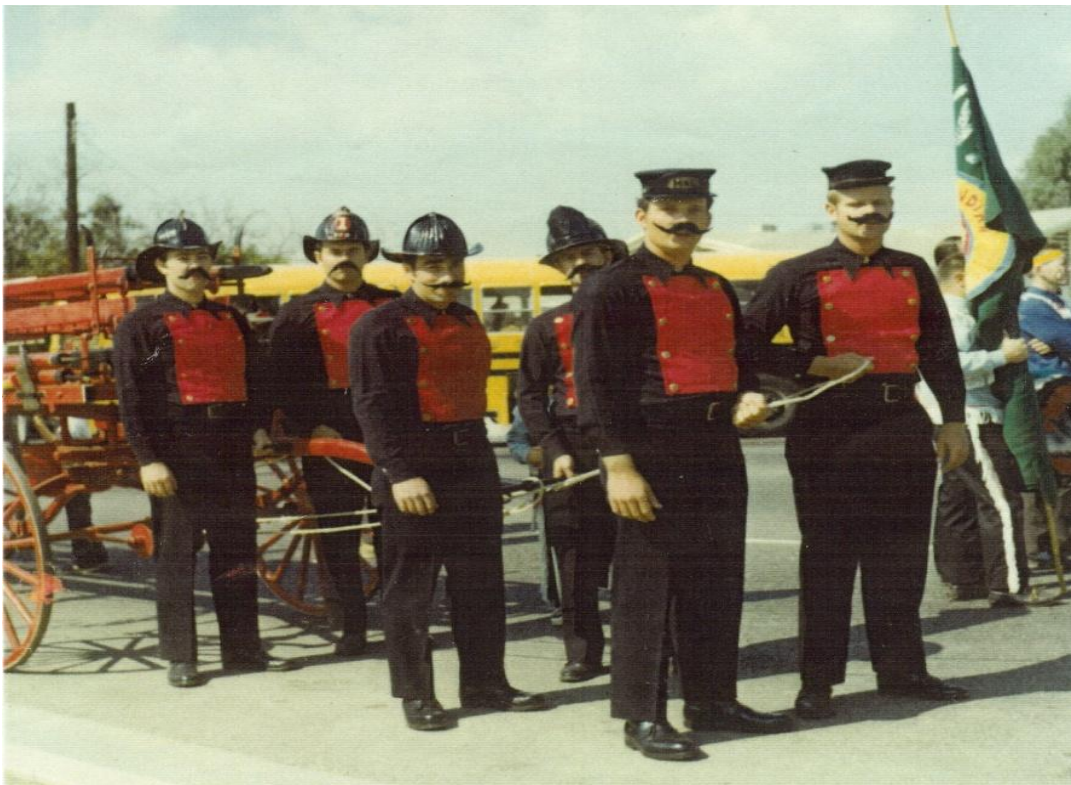
Dashing young Firemen !!